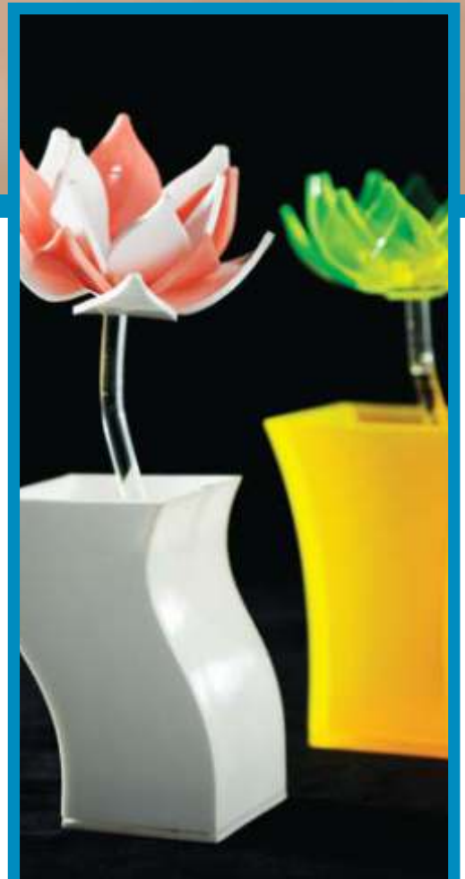
Perspex Frost showing clear and frosted colour